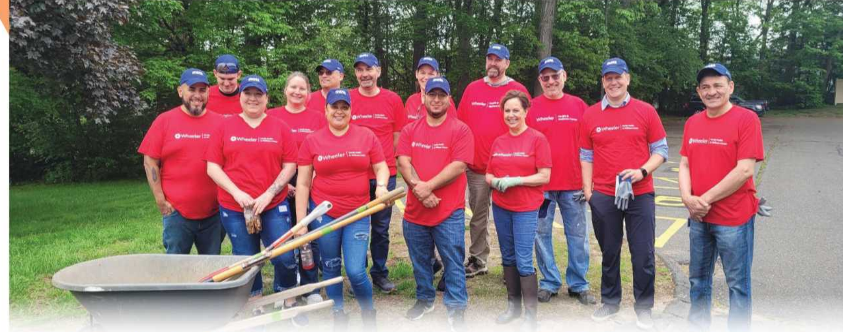
Wheeler's United Way Day of Caring is among the many community activities in which Mott Corporation and IDEX Corporation employees are involved. Pictured are members of the Mott team, who helped to beautify our Northwest Drive location last year.